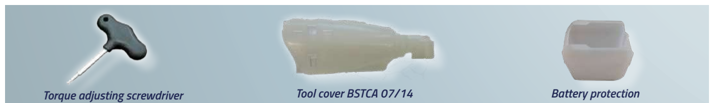
Torque adjusting screwdriver