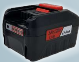
Lithium-ion battery BB200LI-50