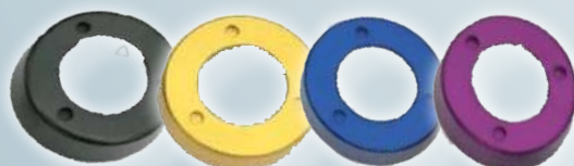
BSTP identification ring