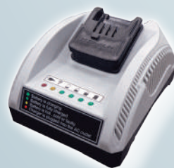
Charger CR19 - BTP