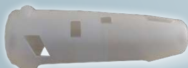
Tool cover BSTP