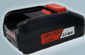
Lithium-ion battery BB200LI-25